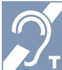
Hearing Loop Available

The meeting room is equipped with a Hearing Loop system. Real time captioning (CART) and interpreting services will be provided.